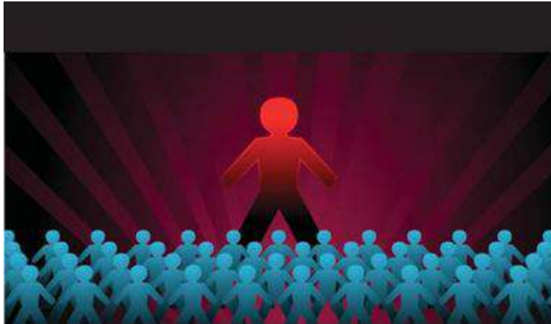
Dominant Traditional Masculinity (MTD)