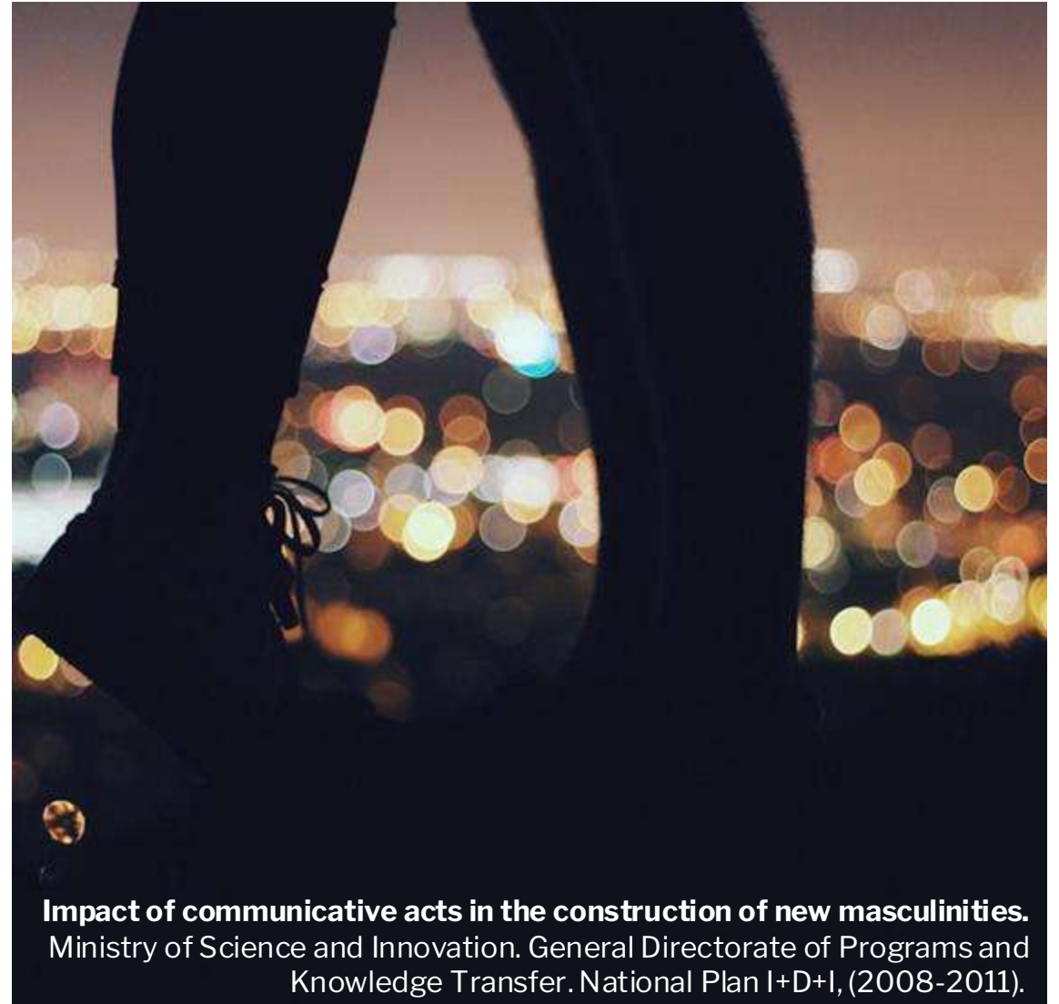
Impact of communicative acts in the construction of new masculinities. Ministry of Science and Innovation. General Directorate of Programs and Knowledge Transfer. National Plan I+D+I, (2008-2011).