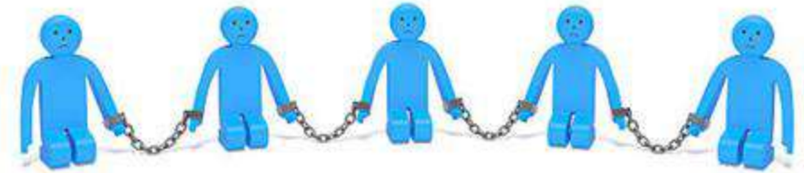
Oppressed Traditional Masculinity (MTD)